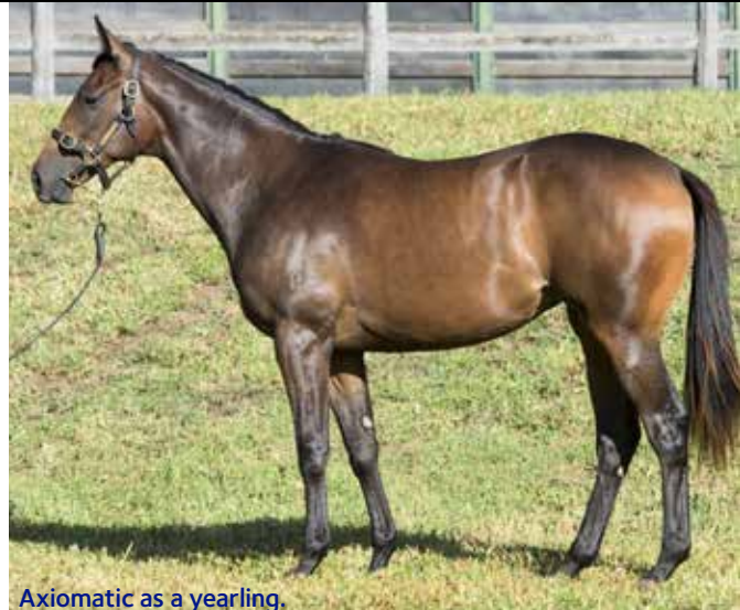
Axiomatic as a yearling.