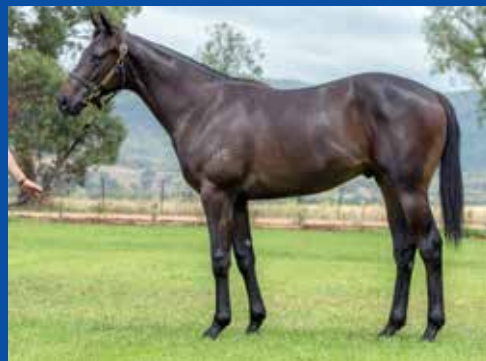
Lot 326 Savabeel - Posy colt