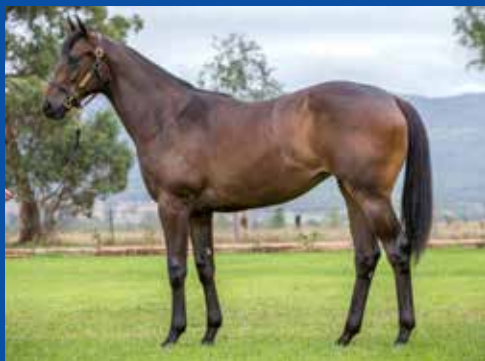
Lot 198 Savabeel - Make A Wish filly