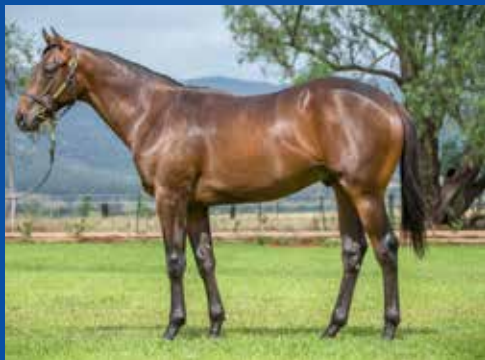
Lot 51 Savabeel - Glam Slam colt