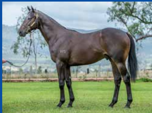
Lot 712 Savabeel - Chandelier colt