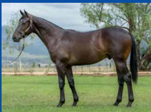
Lot 731 Ocean Park - Corsicana colt

WITHDRAWN Lot 63 Savabeel - Gracie Rose colt Lot 437 Savabeel - Serenade colt