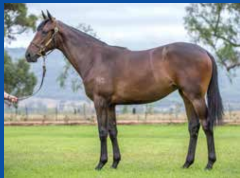
Lot 134 Savabeel - Kashmir filly