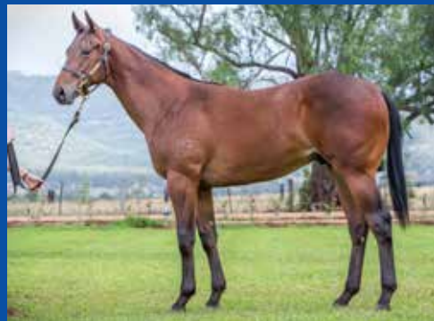
Lot 94 O'Reilly - Hollywood colt