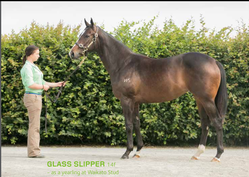
GLASS SLIPPER 14f - as a yearling at Waikato Stud

Cup week has been and gone and I have to say, I did miss being there.